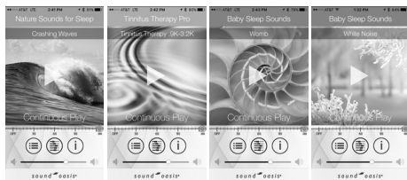
Nature Sounds for Sleep

Sound Oasis has a growing library of APPS to help you and your family sleep. Please see more information at www.soundoasis.com/apps